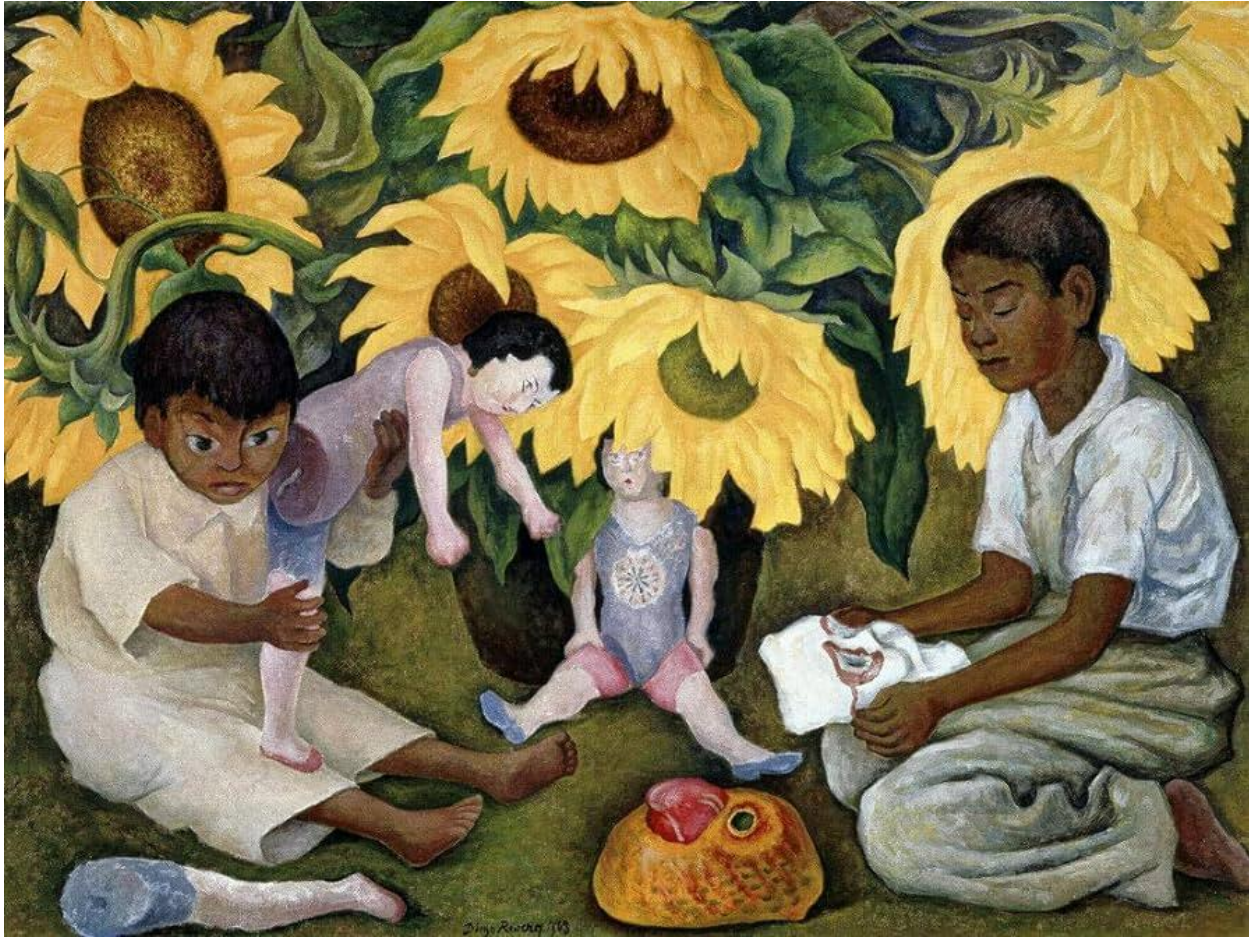
“Sunflowers” by Diego Rivera