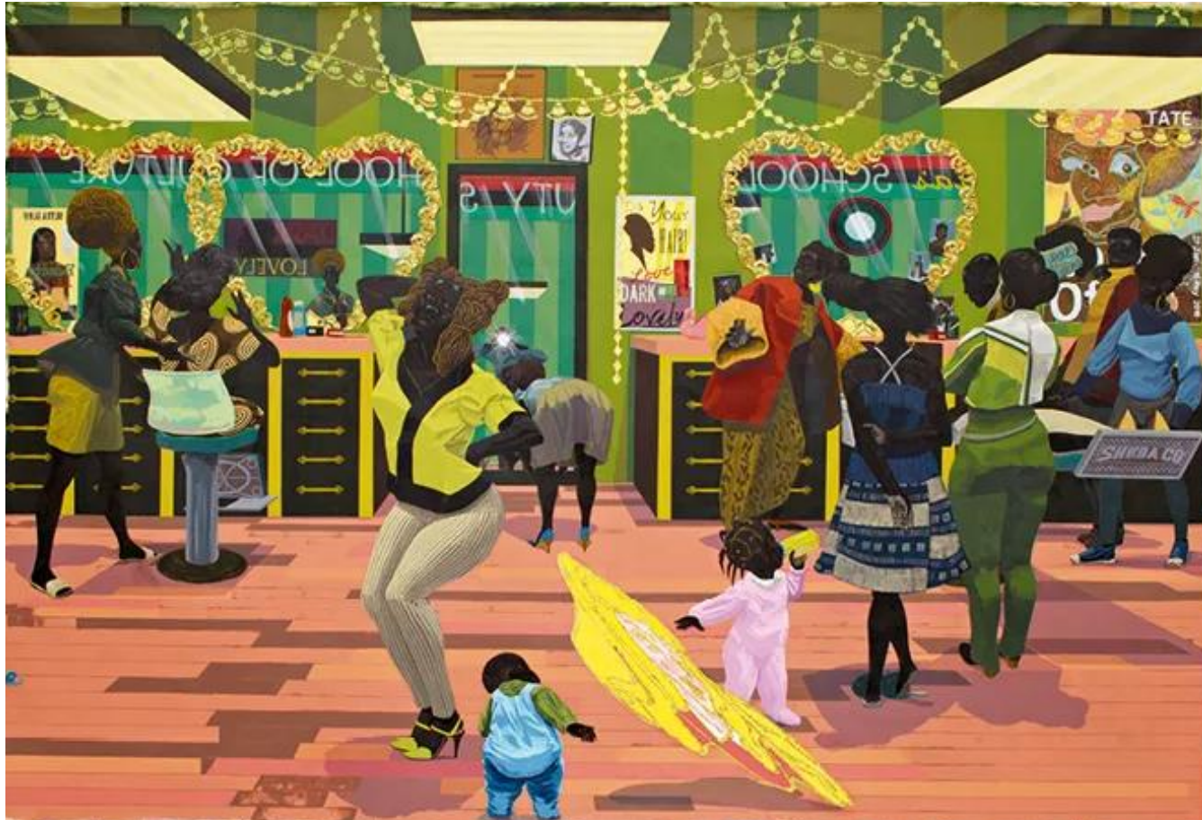
“Beauty Shop” by Kerry James Marshall