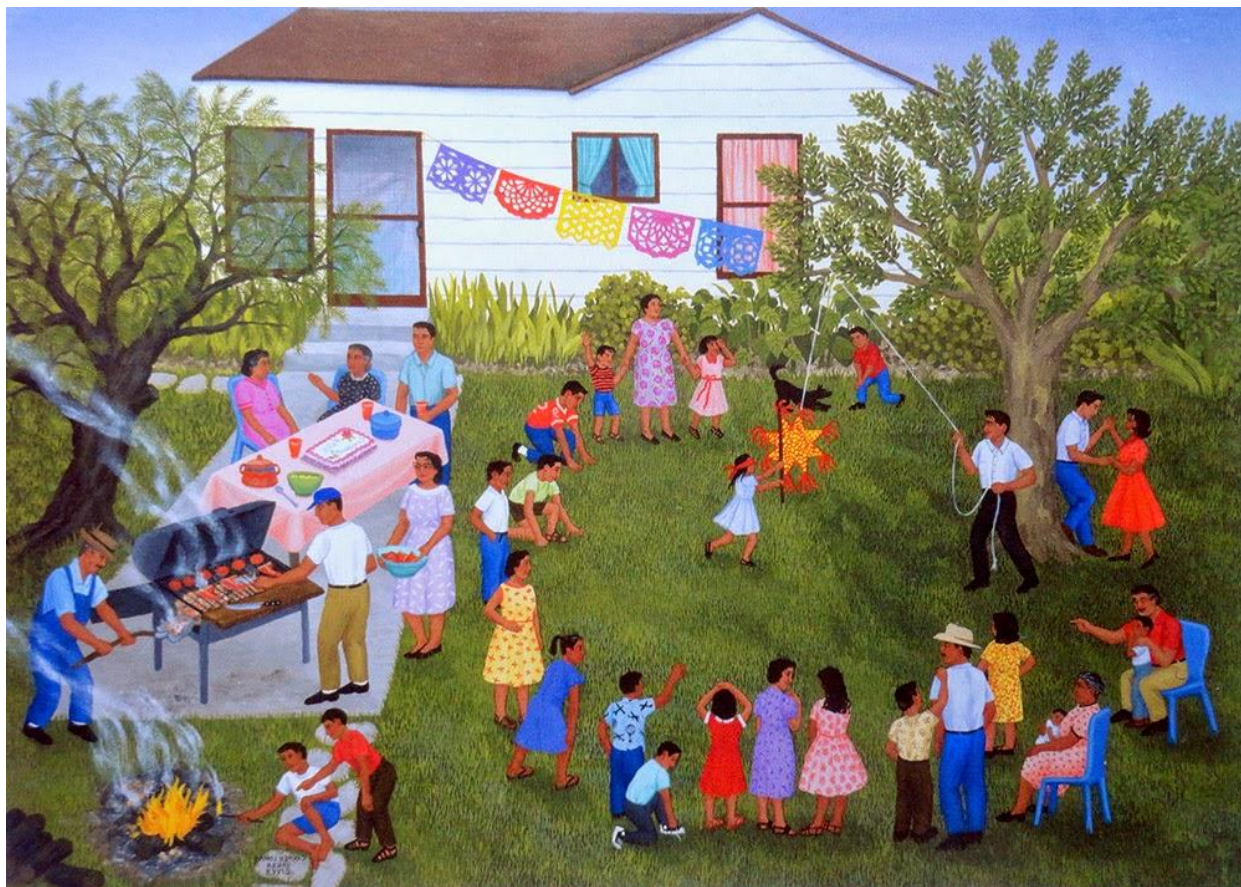
“Barbacoa para Cumpleaños” by Carmen Lomas Garza