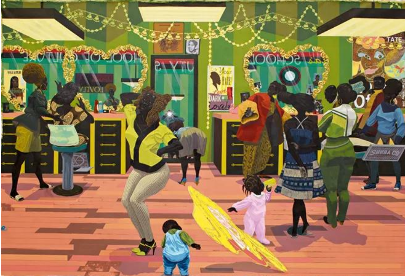
“Beauty Shop” by Kerry James Marshall