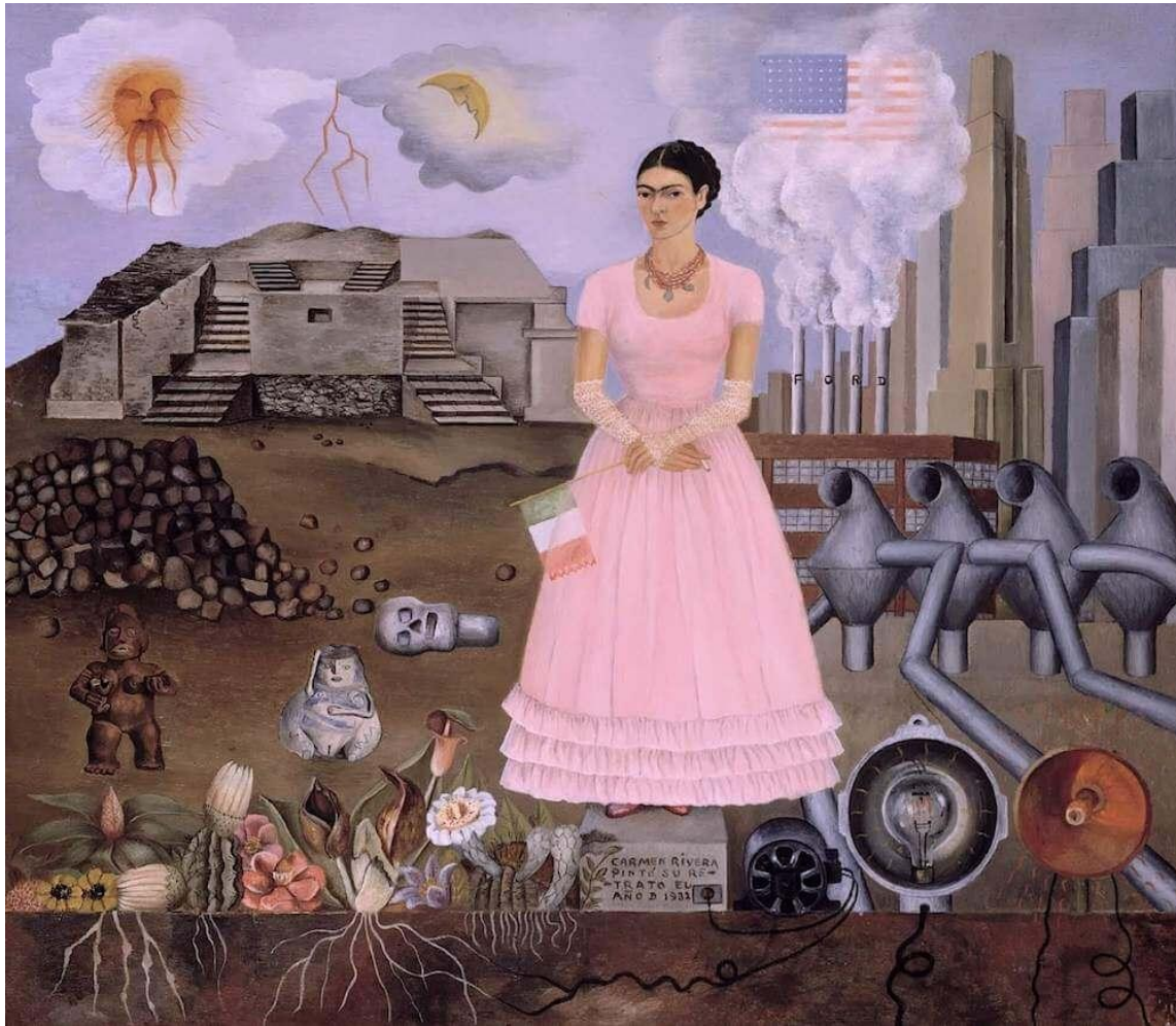
“Self-portrait along the borderline between Mexico and the United States” by Frida Kahlo