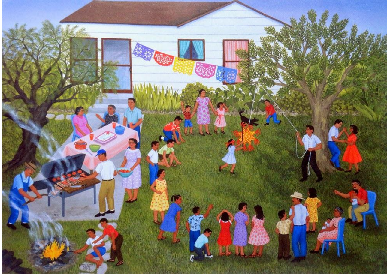
“Barbacoa para Cumpleaños” by Carmen Lomas Garza