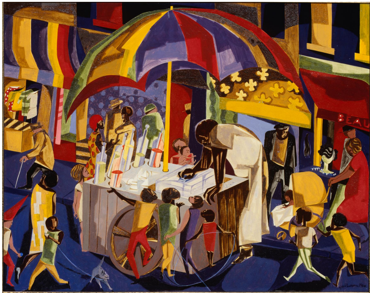
“Ices” by Jacob Lawrence