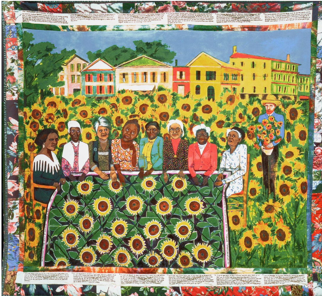
“The Sunflower Quilting Bee” by Faith Ringgold